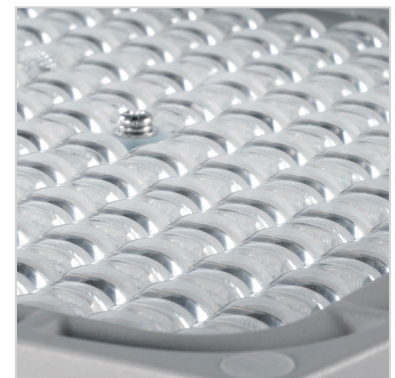
The ProFlex™ photometric engines enable high efficiency.