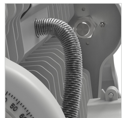
All exposed cabling has bird proof conduit