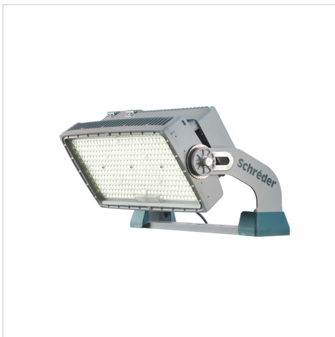
BRITELINE GEN2 | BRITELINE GEN2 1 Module