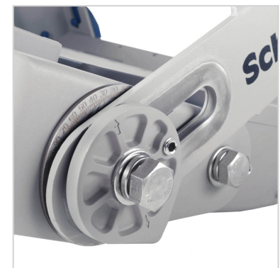
Its bracket layout enables BRITELINE GEN2 to be orientated in different axes to provide accurate photometry.