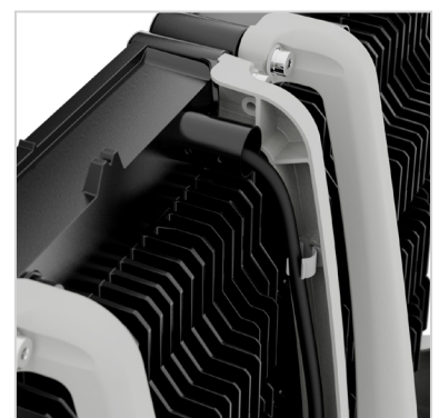
Die cast aluminium heat sink for excellent thermal management