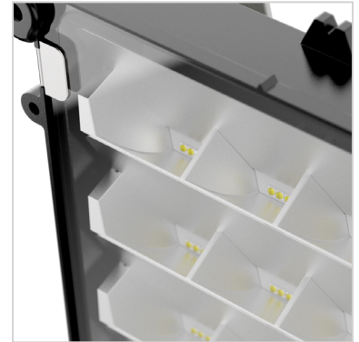
Precision optical design, controlling spill light