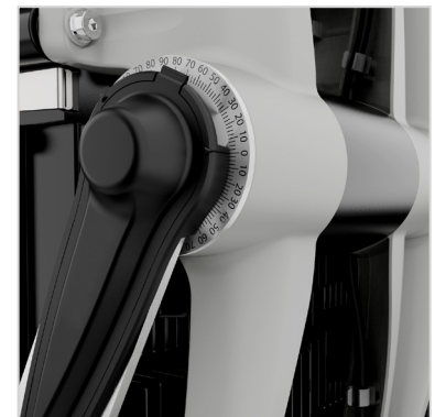
Precise aiming with protractor and locking device