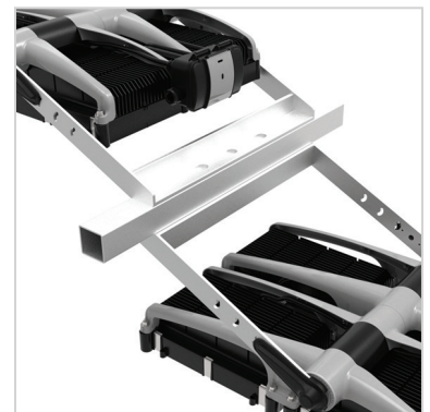
Heavy duty trunnion arm, suitable for under and over slinging